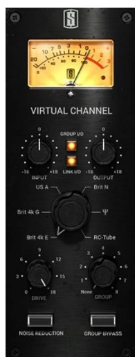
Figure 6: Virtual Channels; ›Brit 4k E‹ is the SSL 4000E, ›US A‹ is the API 1604, ›Brit N‹ is the Neve