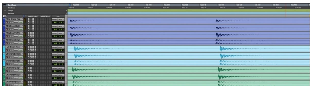
Figure 9: Snare timing of all three mixes

The guitar sounds (two tracks of Gibson Les Paul and two of Gibson Explorer, each of them panned hard left and right) were recorded with Direct Injection (DI) tracks, allowing the use of amplifier simulations. Half of the guitars in the Teutonic mix were sent through an Engl E646 Victor Smolski amplifier (by Engl), the other half through an Engl 530 (by Brainworx), all with Engl cabinets. The guitars of the American mix went through two different Mesa Boogie Rectifier simulations (by Brainworx), each with nationally branded impulse responses (Figure 10). The British guitars were amplified with a Marshall JCM800 simulation (by Brainworx) with different settings and impulse responses. The Engl, Mesa Boogie, and Marshall amplifiers added distorted colours to the bass tracks, depending on each country.