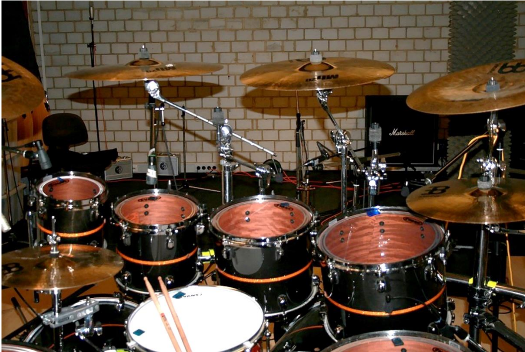
Figure 1: Drum recording room of Twilight Hall studio 10

Apart from the production aesthetics, most of the interviewed producers were convinced of performative differences that were particularly evident in drum playing. In accordance with stereotypes, Teutonic performances were described as ultra-precise and sterile due to the exact internal alignment of drum instruments and the ensemble synchronisation. The snare drum had to be exactly on the grid or even slightly ahead so as not to mask the all-important kick drum, contrary to American and, to a certain extent, British performances. Strongly influenced by jazz and rhythm'n'blues, they tended to be laid-back, with the snare slightly behind the beat. Greek Mikkey Dee is one of the few drummers Bauerfeind has worked with who manages to play both styles. On Helloween's »Just a Little Sign« (2003) he performs in a Teutonic style, on Motörhead's »Stone Deaf Forever!« (2003) he plays in an American/British style.