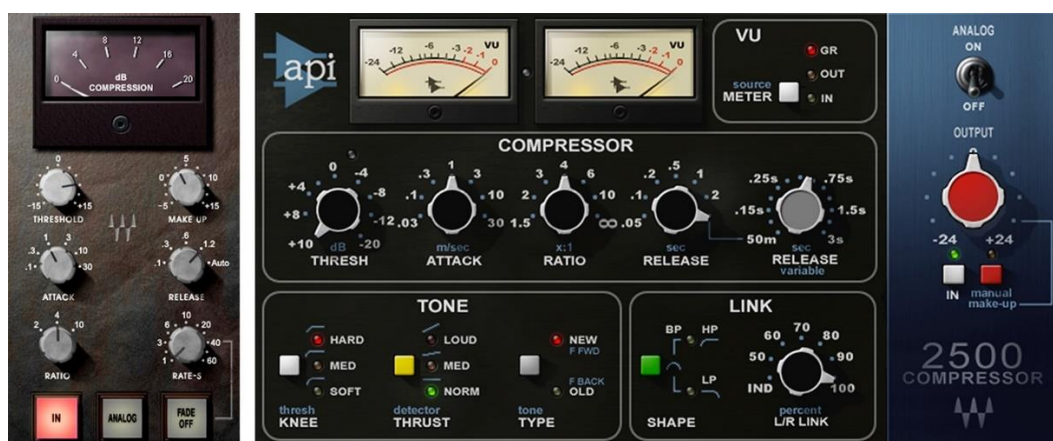
Figure 8: SSL 4000G buss compressor and API 2500 compressor

Additional vocal and bass compression was applied with Waves' emulation of the UREI/Universal Audio 1176 FET and Teletronix LA-3A electro-optical compressor. The compressors and a Waves PuigTec MEQ-5 mid-range equaliser were set to a utility frequency of 50 Hz for the Teutonic and British mixes and 60 Hz for the American mix. According to the manufacturer, this setting should affect noise behaviour and tonal colouration (Waves 2019d: 4). The American vocals were treated with AudioThing's (2019) Type A, a simulation of the Dolby A tape noise reduction unit. In every other respect, the vocal chains were identical in all three mixes. The reverb and delay effects on the vocals were all ›ducked‹ (lowered) by 6 to 10 dB with a compressor during singing to increase clarity, so that the full effects are only heard at the end of the vocal phrases. The stereo image was widened by 120 % for the Teutonic and American versions and by 110 % for the British production, based on America's renowned ›wall of sound‹ aesthetic that was adopted by Teutonic producers.