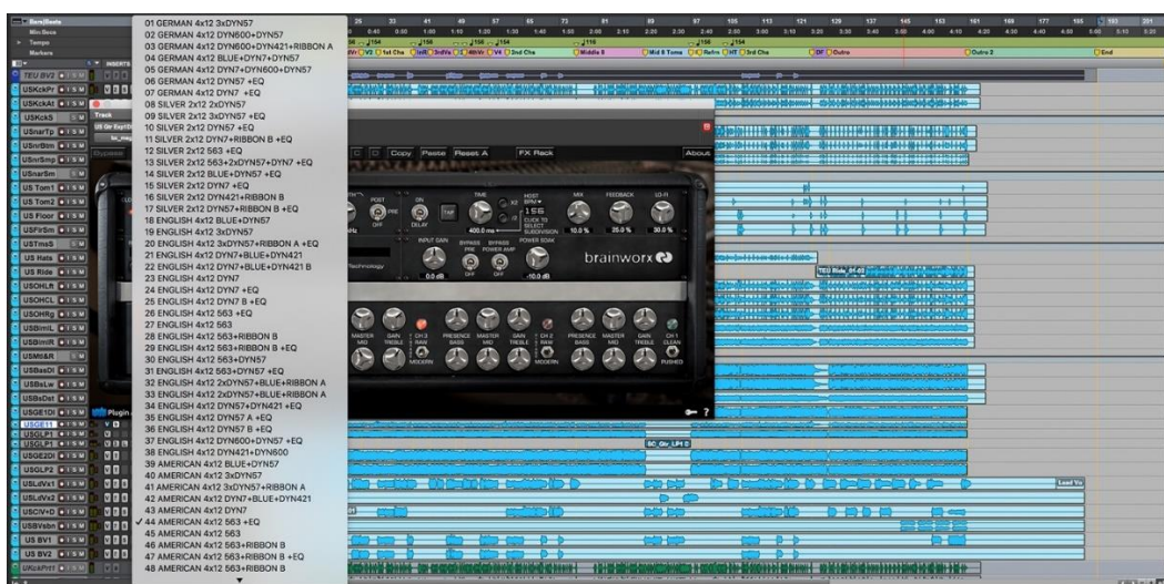
Figure 10: American Mesa Boogie Dual Rectifier amplifier with American cabinet

The guitar sounds (two tracks of Gibson Les Paul and two of Gibson Explorer, each of them panned hard left and right) were recorded with Direct Injection (DI) tracks, allowing the use of amplifier simulations. Half of the guitars in the Teutonic mix were sent through an Engl E646 Victor Smolski amplifier (by Engl), the other half through an Engl 530 (by Brainworx), all with Engl cabinets. The guitars of the American mix went through two different Mesa Boogie Rectifier simulations (by Brainworx), each with nationally branded impulse responses (Figure 10). The British guitars were amplified with a Marshall JCM800 simulation (by Brainworx) with different settings and impulse responses. The Engl, Mesa Boogie, and Marshall amplifiers added distorted colours to the bass tracks, depending on each country.