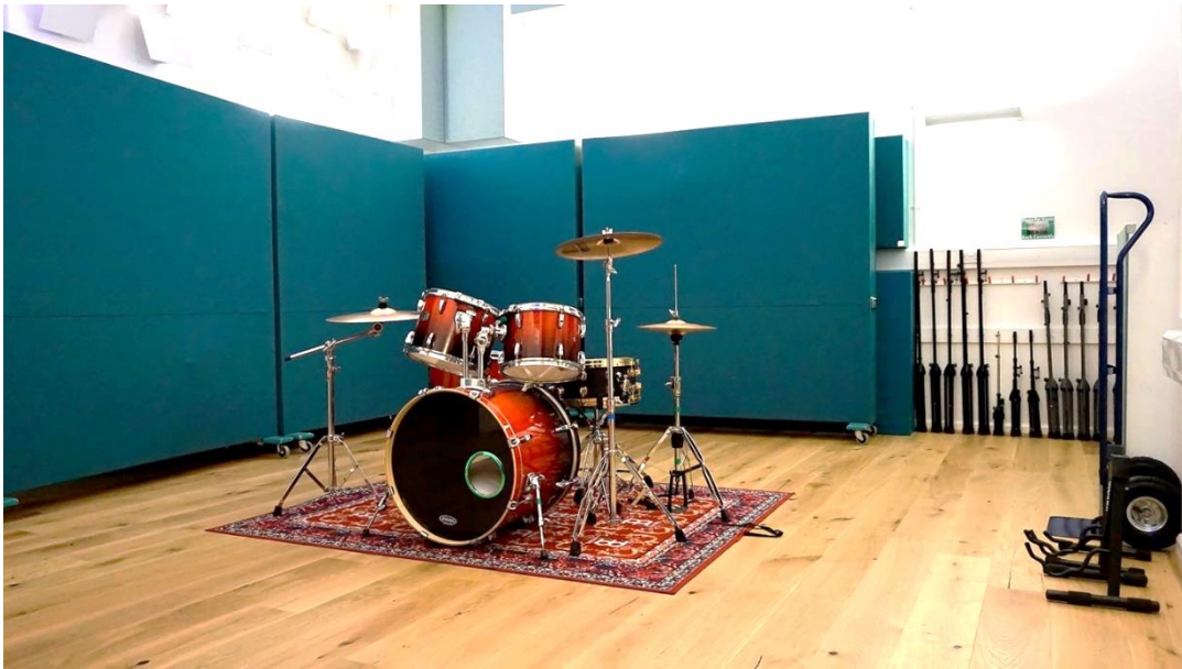
Figure 2: Live room of the recording