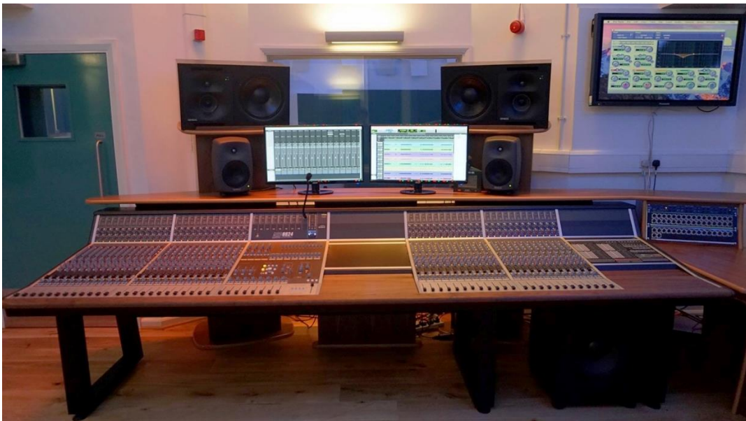
Figure 3: Control room with Audient ASP8024-HE desk