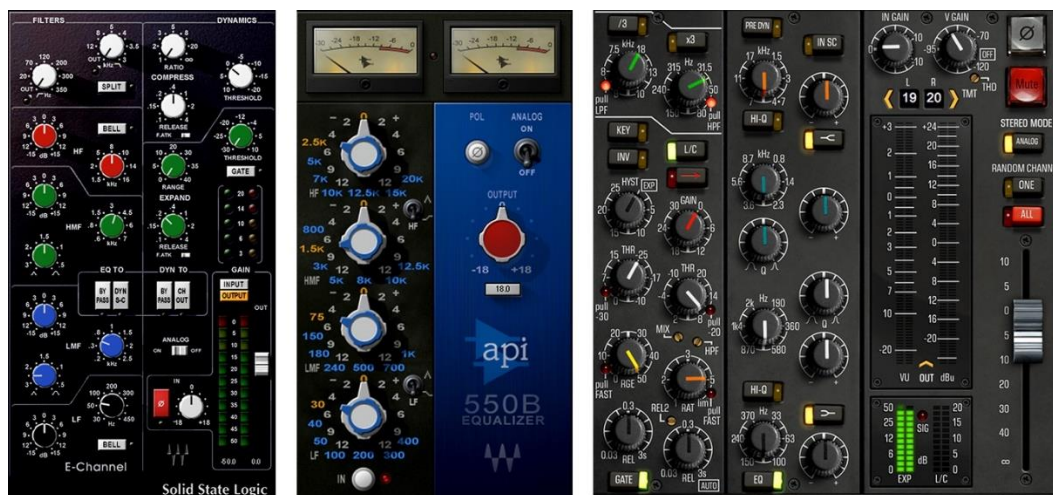
Figure 7: SSL channel strip, API equaliser, and Neve channel strip