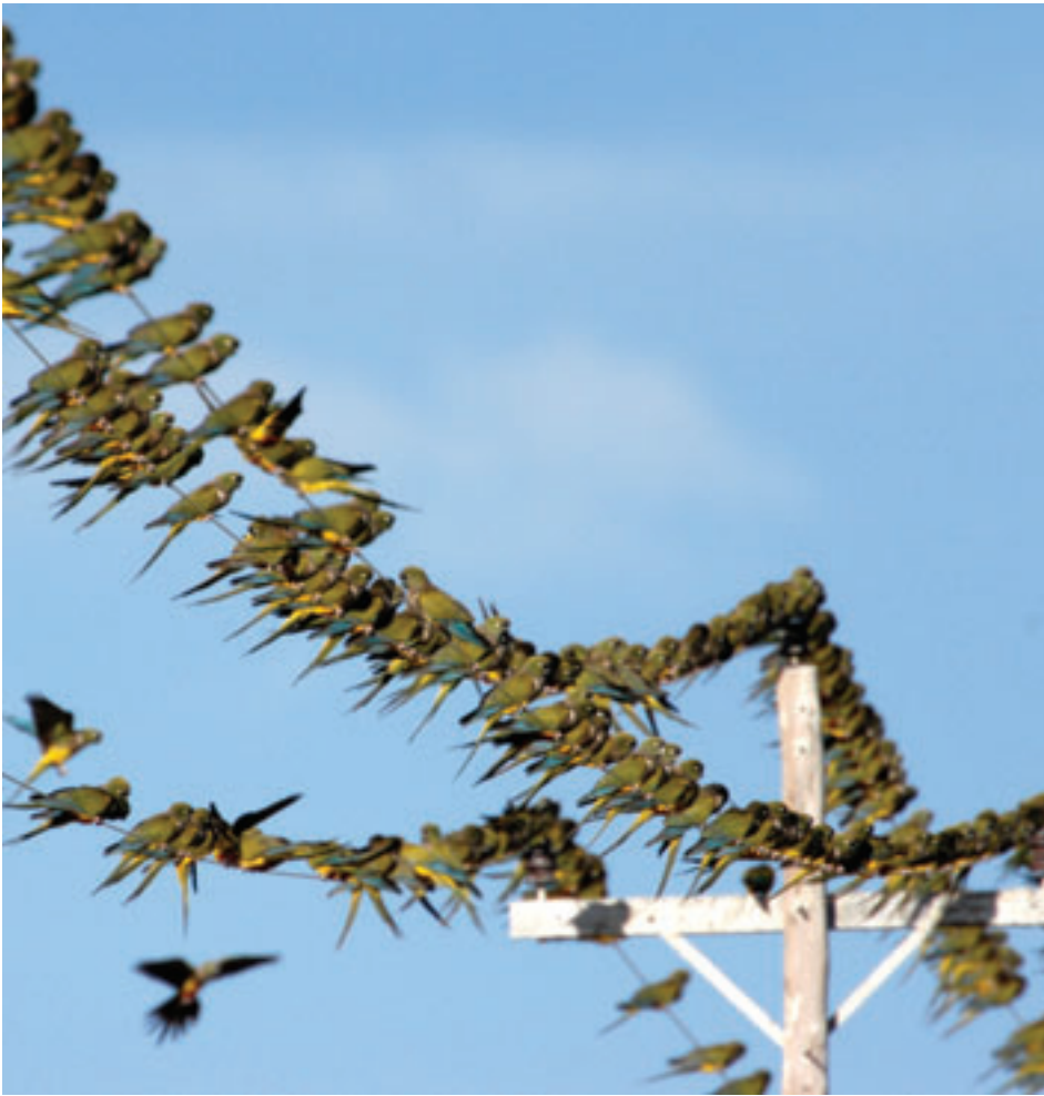
Thousands of Burrowing Parrots line the power lines in the village of El Cóndor, Patagonia, Argentina to roost. Since breeding birds spend the night with their chicks in the nest burrows, these birds are all non-breeders associated with the colony.

after the late broods hatched and well before the first sightings of fledglings outside their burrows. Thus all the counted parrots were close to the beginning of their second year of life or older.