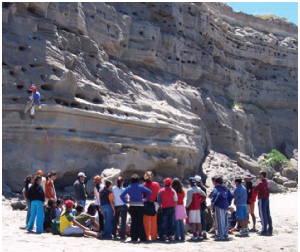
A guided visit to the colony during nests controls.

Despite our conservation efforts, some of the threats persist. Just as a very worrying example, last February, some federal authorities of Argentina (in charge of the programme Elé, which harvests Blue-