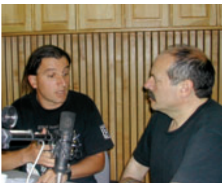
An interview at the most important broadcasting station in Río Negro.