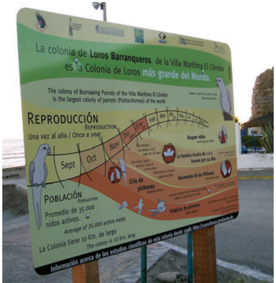
One of the road signs providing information about the colony and the parrots.

San Javier. We expect to soon get official permits for extending the educational campaign this year to the nearby city of Carmen de Patagones in the province of Buenos Aires. And we will conduct more guided visits during next breeding season in October-December.