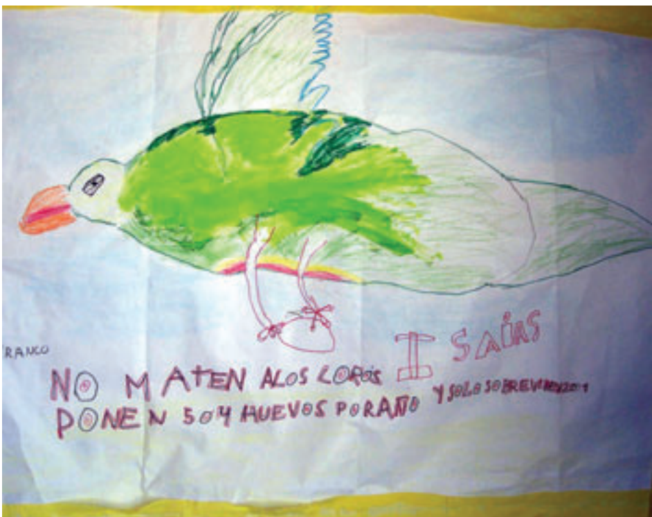
One of the posters made by the children of El Cóndor.

Also in order to divulge the importance and necessity of legal protection of the Burrowing Parrot colony at El Cóndor we gave two lectures during last fieldwork at El Cóndor. The first one, on 08/12/04, was given at the university in Viedma (Universidad Nacional del Comahue) and organized by the members of the Association of Tourist Guides of Viedma. The second one, on 07/01/05, was given at the local library of El Cóndor and organized by the library members. Both lectures were very popular and many people assisted.