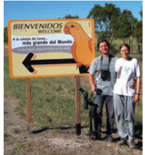
One of the road signs guiding the tourist to the colony.

fronted Amazons ( Amazona aestiva in northern Argentina for sale to the international pet trade) asked the provincial government in Río Negro to authorise the "harvest" of nestlings and adult Burrowing Parrots from the colony at El Cóndor for the international pet trade. Fortunately and following our advice, the provincial government of Río Negro answered the Argentinean federal government that the only authorised uses of the colony will be those related to eco-tourism. Since 2003, we have been promoting the importance and necessity of protection of the colony among local people and the national and international community. The former through an educational campaign targeted to children at local primary schools, the latter through divulgation articles in conservation journals. As we announced in PsittaScene Vol 16 No 4 : 16, an educational campaign was carried out in primary schools of Viedma, El Cóndor and San Javier (province Río Negro, Patagonia,