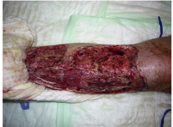
Fig. 1. Left lower leg at day 3 after admission.

For further diagnostics, tissue samples and swabs from all infected areas were taken intraoperatively. Blood cultures were also taken at different time points. But no causative pathogen could be identified. Because of further increased inflammation markers and clinical deterioration, the anti-infective therapy was supplemented by Levofloxacin ( 2 \times 500 mg/d) and Daptomycin (1000 mg loading-