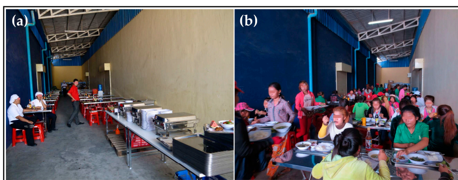
Figure 1. (a) Setup of the temporary canteen in a roofed area at factory site; and (b) dining area during lunch break (Depicted individuals were anonymized).

Following enrolment and baseline data collection in April 2015 [5], 223 female workers (<31 years old, non-pregnant and nulliparous) were randomly allocated in equal shares into an intervention arm (six months of free lunch provision during workdays) and a control arm (equal monetary compensation at the end of the study). The factory was previously not operating a staff canteen. A temporary canteen (including serving counter, dining area and crockery collecting station, about 100 seats capacity) was installed specifically for the LUPROGAR study. For this purpose, the management provided a roofed outdoor area (around 150 m 2 ) at the factory site (see Figure 1). All needed materials and furnishing were locally purchased at markets and specialized shops (see Table 1). Total costs per seat amounted to 28 USD.