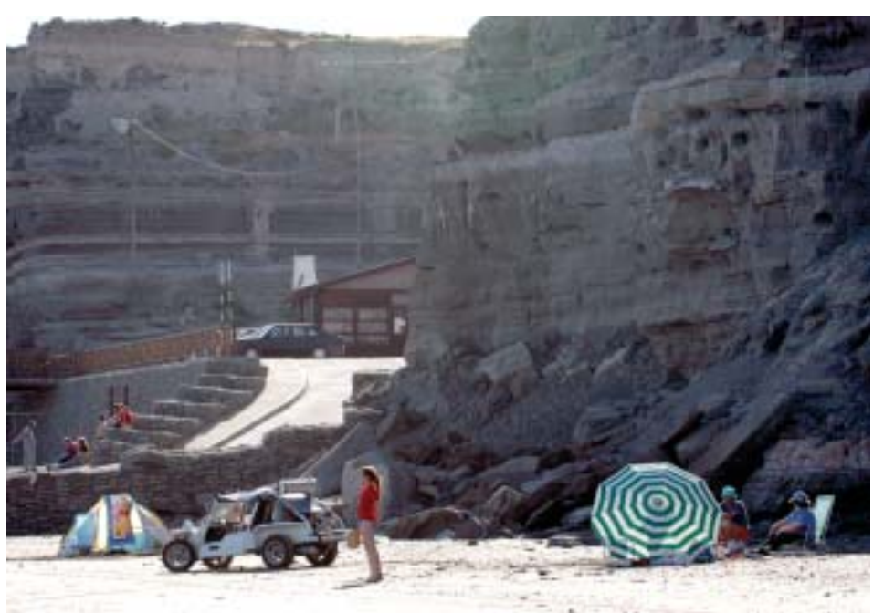
See how close the visitors at the beach are to the nests!

From a scientific point of view, the season was also a complete success. We finished counting the nests in the colony. We are now working on a detailed description of the colony and we hope to publish it soon. This year, for the first time, we caught breeding parrots which we ringed as chicks 4 years ago. And they were breeding only a few metres from the nests where they grew up! During this season we monitored the development of 145 chicks and studied the immunocompetence of some of them, we caught, measured and ringed 52 breeding adults, carried out a census of nonbreeders, studied the load of ectoparasites, investigated the presence of hemoparasites and took feather samples for the study of parrot coloration using spectrometry in the lab. A lot of work with data and in the lab is waiting for us now!