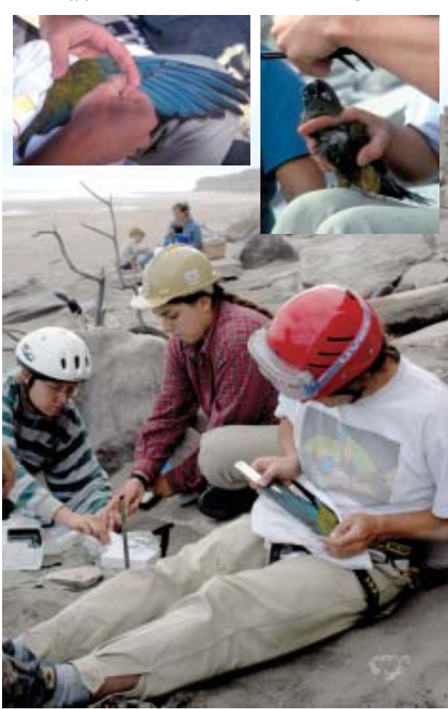
Record various measurements and details.

(APN) of Argentina. The parrot colony area is now also considered a candidate for the new National Park in the Arid Patagonian Steppes of Argentina.