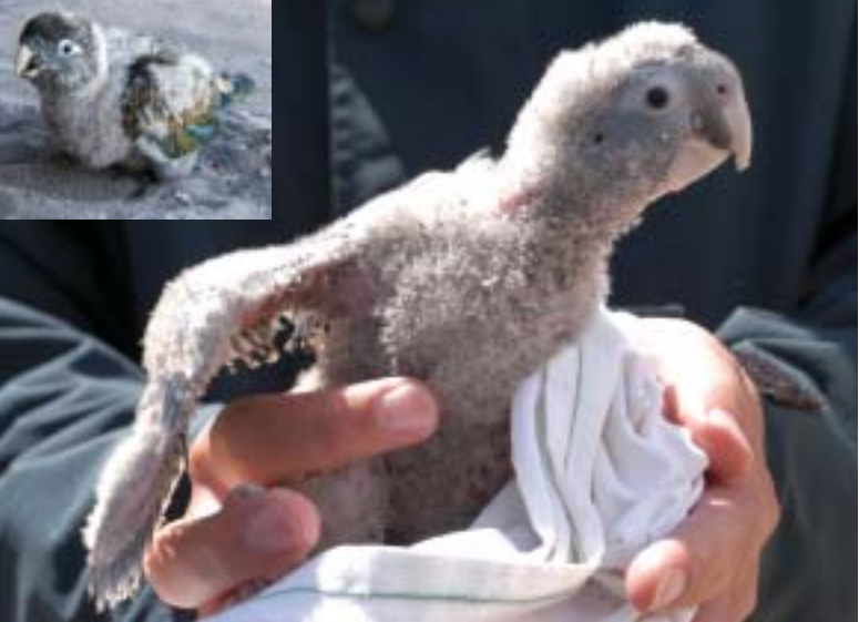
Each stage of a chick's development is recorded. Inset, chick waiting to be fed.