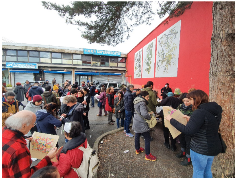
Fig. 2: Participants collect the nianhua prints and prepare for their distribution in Piazza dell’Immaginario .

in his exploration of Macrolotto Zero, this messy “semiotic appropriation of public space” was taken as a focal point for the propagation, by public opinions, of derogatory meanings connected to the neighborhood as an unruly space. It became “a marker of the lack of integration in the city and of the division between Italian and Chinese communities.” 44 Art here has significantly changed the meaning of this part of the city and, from a spatial perspective, it has contributed to the conceptualization of this portion of the neighborhood as ‘the heart’ of Macrolotto Zero; it has done so by spontaneously reshaping the function of this urban space into a successful public area, which is now used by locals (mostly Chinese residents) as a gathering spot. As a testimony to the relevance of this place, it was exactly from the public seating located under the red wall that Teng’s art performance started.