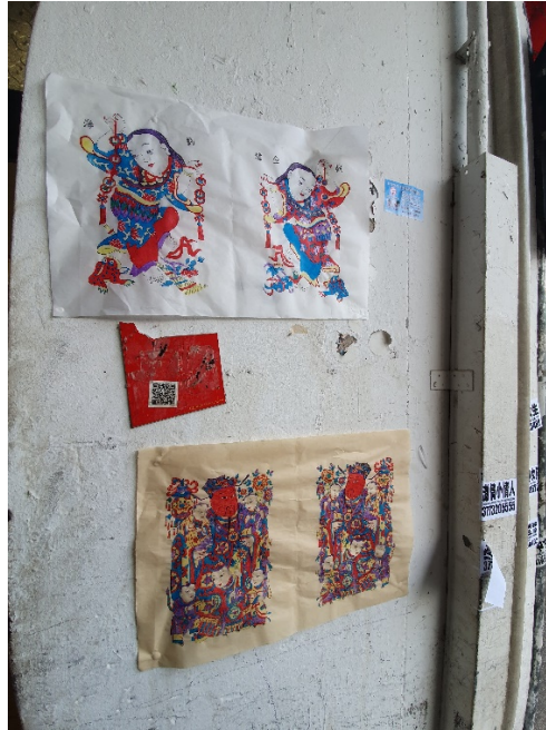
Fig. 3: Nianhua prints, stickers and a corner of the red caption that accompanied Dryphoto's 2015 art intervention.

advertisement barcodes and stickers with improvised massage parlour numbers and escorts' private contacts, which have been at the centre of public controversies since at least 2014 (Figure 3).