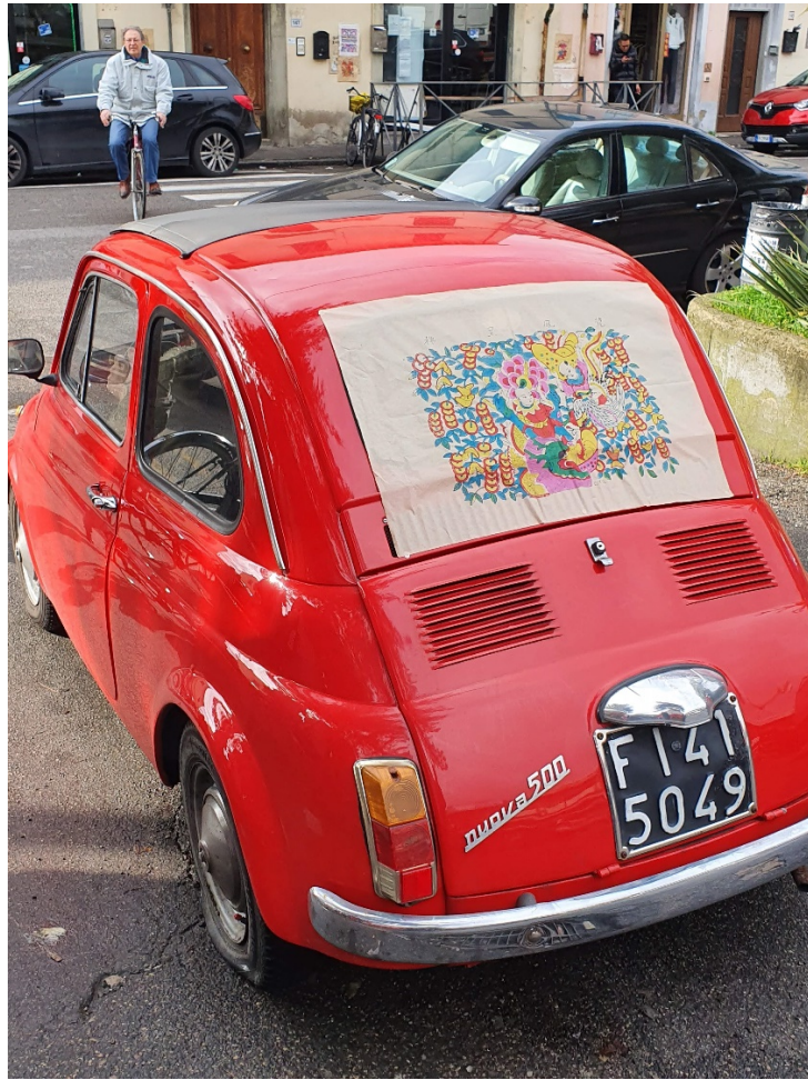
Fig. 7: A bright red Fiat 500 remains parked in Piazza dell'Immaginario throughout the art performance.

Teng's approach to art interventions resonates with the power of ephemeral urban activism to elicit new imaginaries. As Mekdjian elaborates: "in this limited spatial and temporal interval, the city and urban practices allow the possibility to other imaginaries and practices. The ephemeral is an integral part of how these interventions function; they aim not to install a new system but to constantly destabilize the established and the legitimate." 56 Yet, as we attempted to demonstrate through our historical overview of how the visual landscape of the neighborhood has changed over the years, the case of Macrolotto Zero shows how different interventions should not be framed as isolated moments of antagonism. Rather, they should be framed as parts of a complex system of layered, successful and unsuccessful interventions, where formal and informal actions by different stakeholders cooperate, clash, and mix in a continuous and spontaneous process of transcultural placemaking. In this article, we have decided to analyze a project like Piazza dell'Immaginario , created by Dryphoto in collaboration with Ecòl,