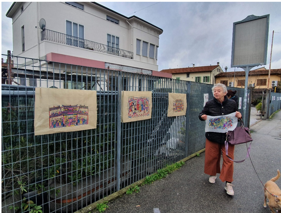
Fig. 6: A resident of Macrolotto Zero collects one of the nianhua prints posted in Via Pistoiese.

exchange with residents (Figure 6). It was in these instances that the transculturating and antagonistic drive of Teng's action emerged more strongly, destabilizing everyday urban interactions and the exclusionary narratives that still dominate representations of the neighborhood in the local media. As Sequeira notes, artistic interventions that engage with the layered history and immaterial culture of a place through direct contact between artists, participants, and local residents have the potential of turning places of encounter into places of sharing, where all actors involved participate in the collective construction of meanings and of new transcultural imaginaries. 53 It is through this collective act of re-imagining that the antagonistic form of Teng's action becomes apparent. Rejecting the hegemonic construction and representation of Macrolotto Zero as a space dominated by exclusionist and xenophobic narratives that present residents of different nationalities as impermeable to reciprocal transculturation, 54 Teng used the nianhua prints to articulate a participatory intervention, where all social actors involved were encouraged "to act outside or beyond what is known, understood and sanctioned." 55