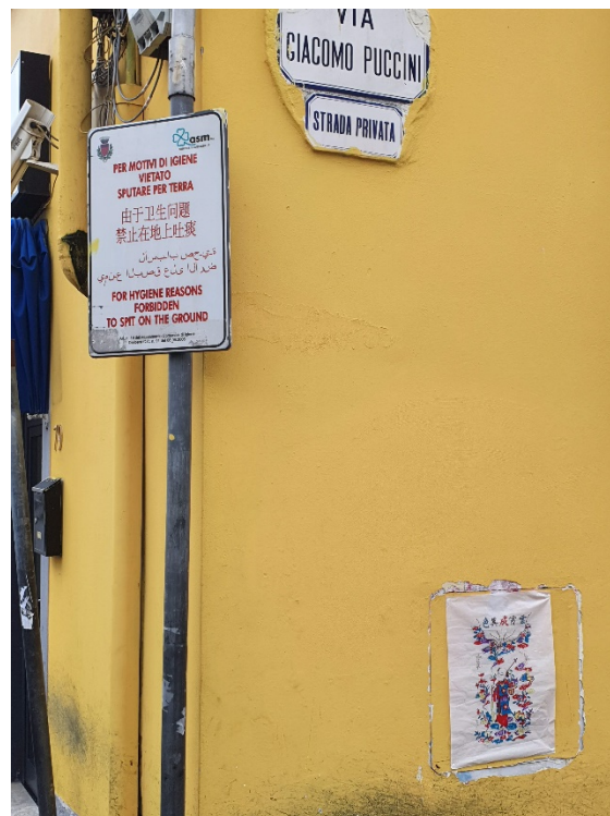
Fig. 5: Nianhua prints next to one of the many multilingual “cautionary” street signs installed by the City Council.

It is also important to note how in many instances participants in the intervention chose to distribute nianhua prints directly to passers-by, generating spaces of engagement and