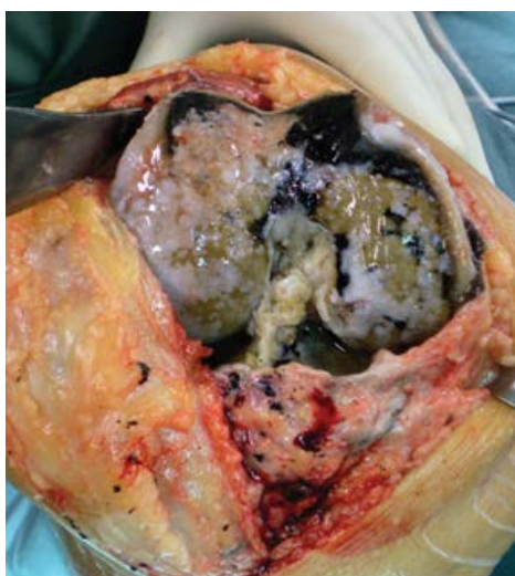
Figure 2b: Intraoperative findings of the right knee.

In arthritis, rapidly progressive disorders of the spine or peripheral joints, wherein the rheumatologic diagnosis (ANA, anti-CCP, HLA-B27, eg) can deliver no suitable values, an accumulation disease should be assumed as a cause and excluded. In diagnosis of ochronosis the level of alcapton in blood and urine together with the pathognomonic urine is conclusive for the disease. If these values seem unremarkable, provides only the exact and also repeated history indications of an exogenous cause, or exposure of the person concerned.