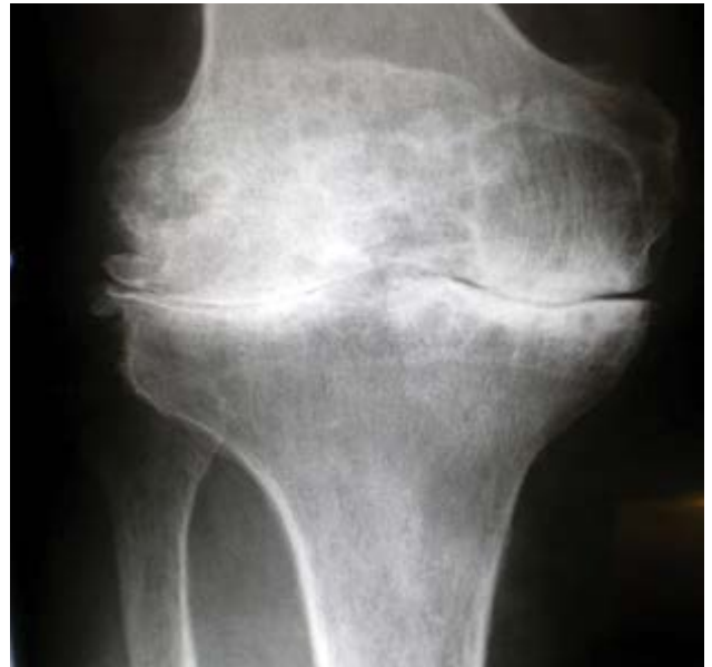
Figure 2a: X-ray of the right knee.

When retesting requirements postoperatively the idea of further clarification of the unusual findings towards ochronosis comes on. A determination of homogentisic in urine is not performed preoperatively.