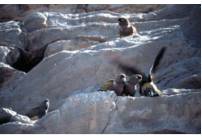
Burrowing Parrot family at nest entrance.

The conservation status and the distribution range of the Burrowing Parrot in Argentina were last studied at the end of the 1970s and early 1980s. No systematic monitoring has been carried out since. Formerly, these parrots were very common in Argentina, but now they are only regionally abundant.