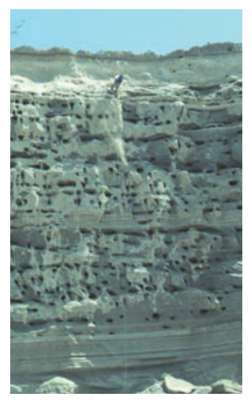
Reaching Burrowing Parrot nest by climbing.

Since 1998, we have been conducting a study of the breeding biology of Burrowing Parrots at the largest and most important colony of this species. The colony is located west of the village El Cóndor (or Villa Marítima El Cóndor or Balneario Massini or La Boca), 30km southeast from Viedma, in the province of Río Negro, Patagonia, Argentina. The colony covers 7.5km of sandstone cliffs. The westernmost kilometre of the colony (41°3'S, 62°48'W) is by far the most densely populated with 6,750 active nests. The habitat in the surroundings of the colony is primarily Patagonian steppe. Remarkably, after an extensive literature review on parrots breeding biology, this population appears to be the largest known colony of parrots in the world.