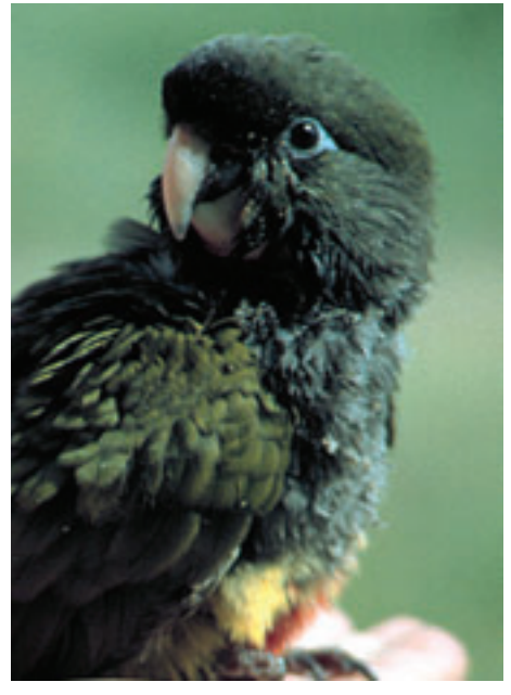
5 week old chick.

In Argentina, the highly gregarious Burrowing Parrot ( Cyanoliseus patagonus ) occurs from the Andean slopes in the northwest to the Patagonian steppes in the south. It generally inhabits open grassland,