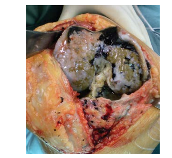
Figure 2b: Intraoperative findings of the right knee.

In arthritis, rapidly progressive disorders of the spine or peripheral joints, wherein the rheumatologic diagnosis (ANA, anti-CCP, HLA-B27, eg) can deliver no suitable values, an accumulation disease should be assumed as a cause and excluded. In diagnosis of ochronosis the level of alcapton in blood and urine together with the pathognomonic urine is conclusive for the disease. If these values seem unremarkable, provides only the exact and also repeated history indications of an exogenous cause, or exposure of the person concerned.